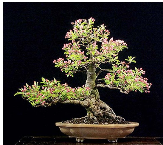
Crabapple by Harvey Carapella