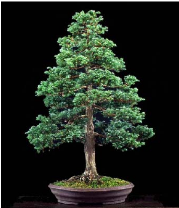
Blue Moss Cypress by Will Hebert