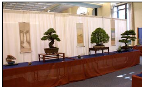
One view of our Spring Exhibition