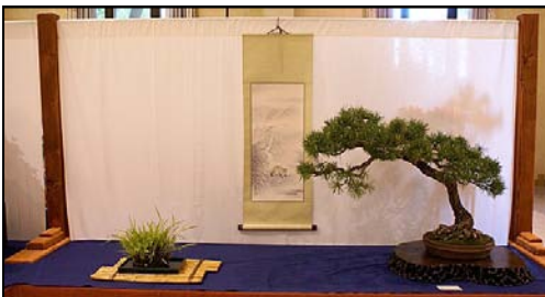
Members Choice Award Winner