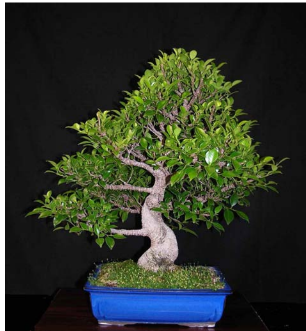
Tiger Bark Fig

October's Bonsai Basics workshop with Arthur Skolnik will be held immediately following the lecture and demo on October 28th. This is free to members, but participants must pay for the plant material. The material fee for the workshop is $45. Each workshop participant will receive a very nice imported Tiger Bark Fig tree with curved trunk in a nursery pot. With Arthur's assistance each participant will prune and wire their tree. No potting will be done. Members need to bring your own tools, some wire, and a box to work in. Please call Ron Maggio at 872-0382 to make your reservation for this special workshop. Members not taking the workshop are invited to stay and watch to see the end results.