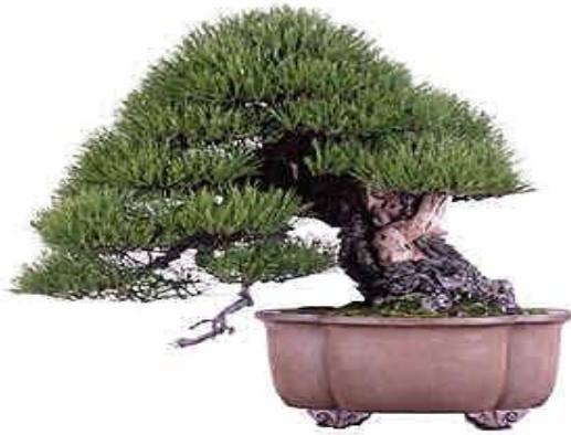
Japanese Black Pine Pinus thunbergii