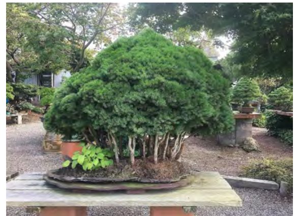
Forest bonsai at Arboretum