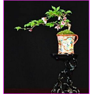
Kojo no mai Cherry in a teacup