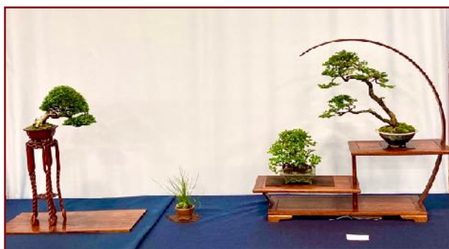
David Knittle Moon Stand Arpag display @ 7th US National Bonsai Exhibition

I am very excited to announce David Knittle workshops (in February) featuring an amazing choice of Bonsai stands or tables. This is literally a once in a lifetime opportunity to learn from a Master and build a Bonsai display table of the highest quality and design.