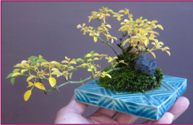
Mame Shohin Bonsai Wild Rose

Is this a Bonsai or an Accent Planting? It's both, it could be exhibited either way. We plant Bonsai on flat rock slabs all the time, this is a ceramic slab. The interesting geometric pattern of the slab contrasts nicely with the texture created by the small Rose leaves. It's a Semi-Cascade style, because the long lower branch extends out horizontally beyond the edge of the slab. The light Yellow of the Fall Rose leaves creates an interesting visual contrast with the darker Teal color of the slab. This contrast would change in Spring when the leaves are Green. In Spring we would have a harmony between the cool Green Rose leaves and the cool Teal of the slab. Green Hues are cool colors.